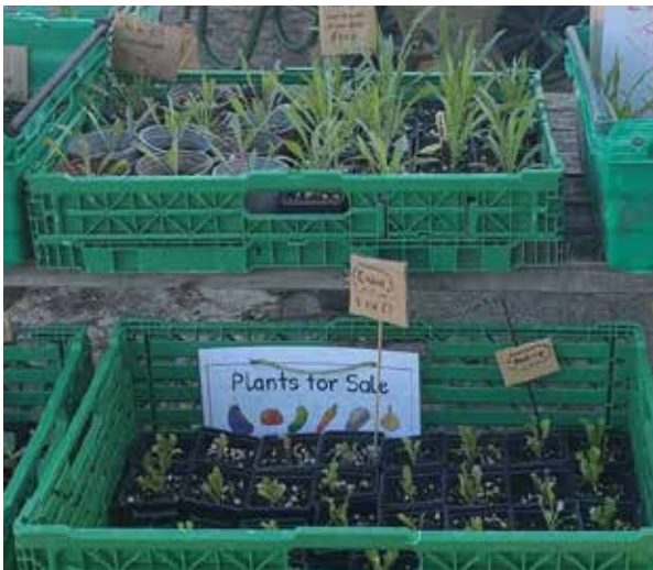
Plants for sale outside the Shop

If you think you can make a regular commitment of an hour or so once a week (we always need extra hands to open and close the polytunnels in the warmer months) please contact Serife on 07939 640 272 or serifedervish@hotmail.com