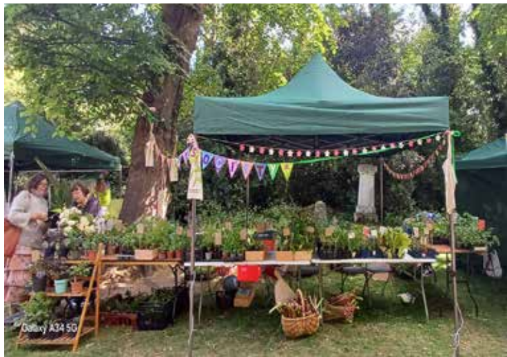
Plants out for sale at Nunhead Cemetery Open Day May 2025